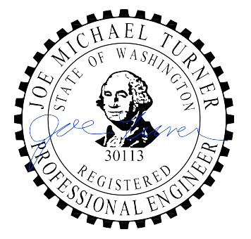
Signed on 2/16/2024