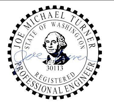
Signed on 2/16/2024