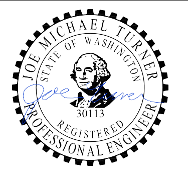
Signed on 2/16/2024